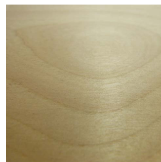
After 1200 grit wet/dry paper