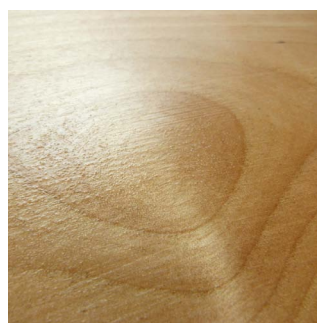
Dry sanding sealer No polishing