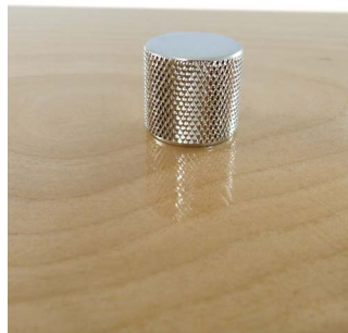
Lacquered surface After polishing