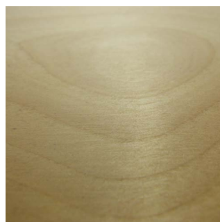
After 1000 grit wet/dry paper