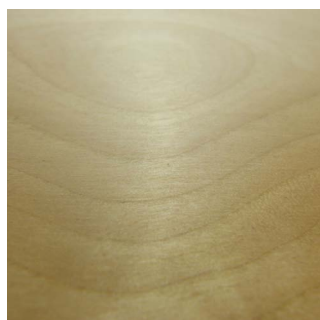
After 2000 grit wet/dry paper