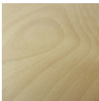
Bare wood sanded to 240 grit