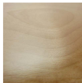
Wet gloss applied