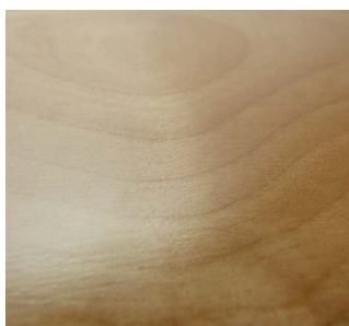
Lacquered surface Before polishing of any kind