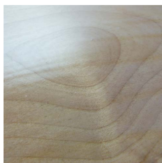
Wet sanding sealer applied