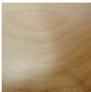
Dry gloss No polishing