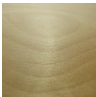
After 1500 grit wet/dry paper