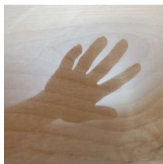
After RF3 polishing compound