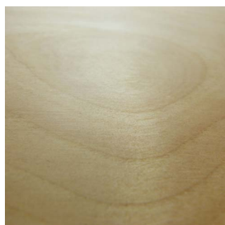
After 600 grit wet/dry paper