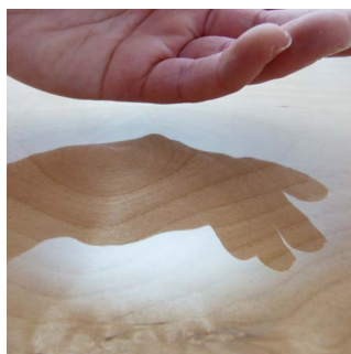
After RF5 polishing compound